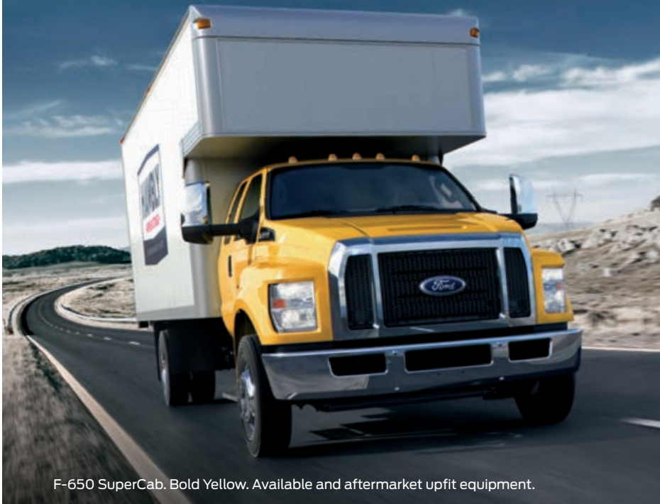
F-650 SuperCab. Bold Yellow. Available and aftermarket upfit equipment.