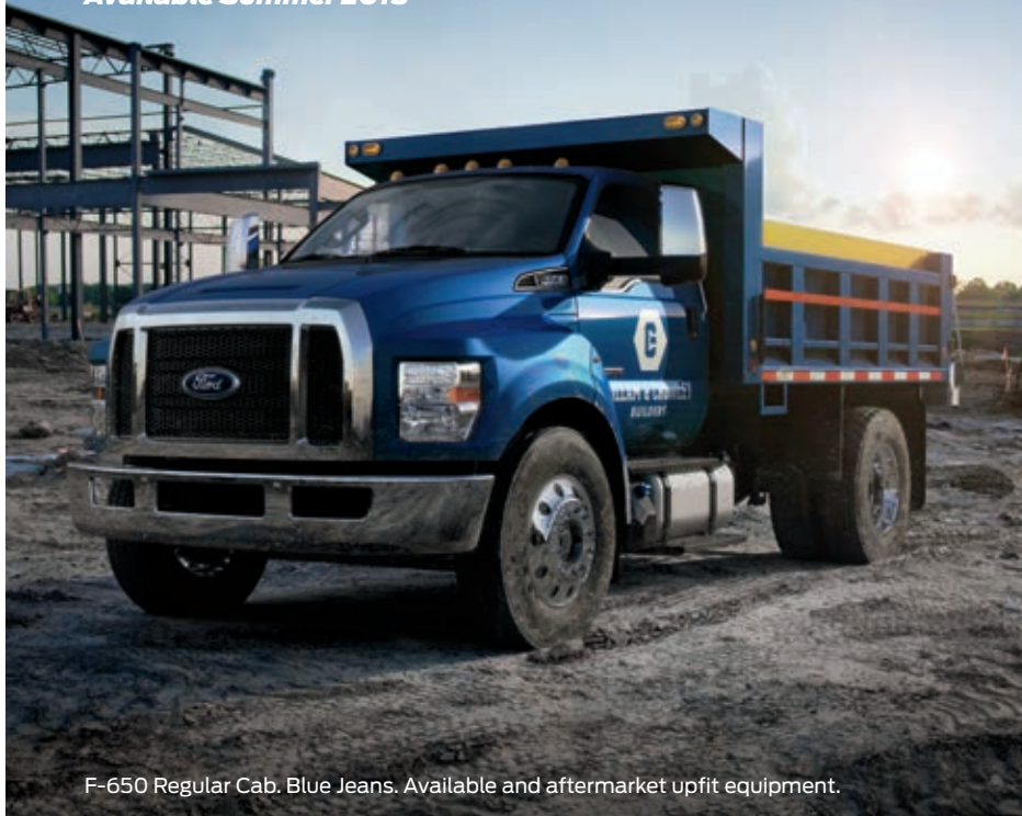
F-650 Regular Cab. Blue Jeans. Available and aftermarket upfit equipment.